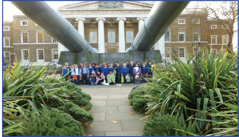
Year 4 enjoyed their trip to the Imperial War Museum this week